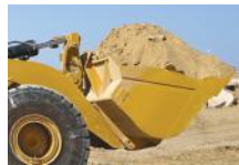
PERFORMANCE SERIES BUCKETS

The Fusion Quick Coupler System allows machines to use a wide range of tools that can each be picked up by machines of varying sizes. Fusion is designed to integrate the work tool and the machine by pulling the coupler and tool closer to the loader, increasing overall lift capability.