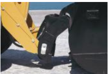
FUSION™ QUICK COUPLER